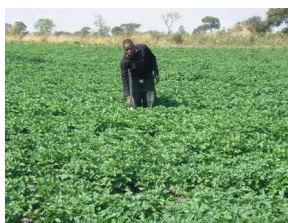
Irrigated Potato field

We thank God for a donation of $2000 that was given to purchase