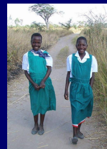
Above: Kids walking to school.

Please pray for God’s guidance, provision and blessing on this endeavour. And please consider partnering with us financially to provide excellent, Christ-honouring education to Malawi’s future leaders.